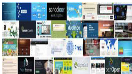
Fig 3.1 Online tools for teaching

while other lessons can only be taught in a physical classroom or lab.